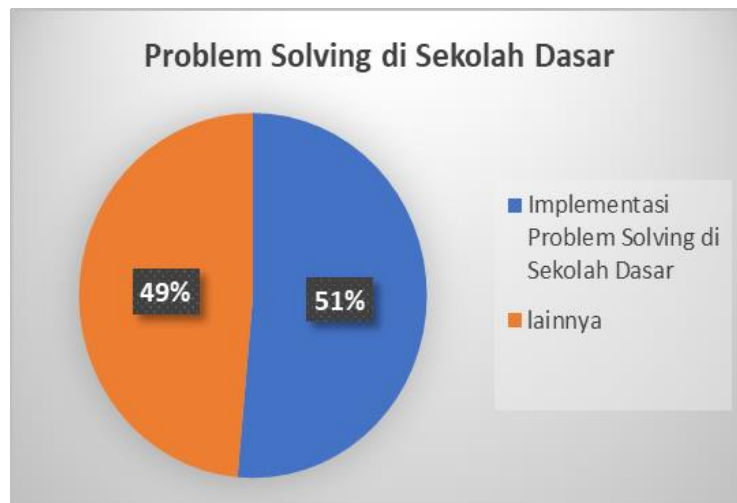
Diagram 1. Problem Solving in Elementary Schools